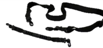
SG-ET5X-SHDRSTP-01 Break away Shoulder Strap