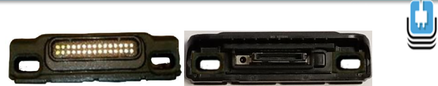
SG-ET5X-RGIO2-01 Replacement Rugged I/O Connector