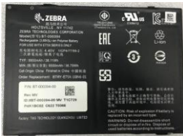
BTRY-ET5X-10IN5-01 10 in. Tablet Internal Battery