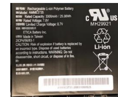
BTRY-ET5X-10IN3-01 10 in. Tablet Internal Battery