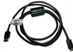
CBL-TC2X-USBC-01 USB-A to USB-C cable