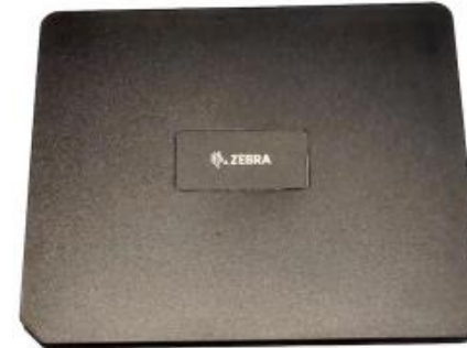
KT-ET5X-10BTDR2-01 ET51/ET56 10" Battery Door