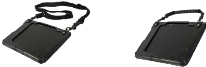
SG-ET5X-HNDSTP-01 Handle strap