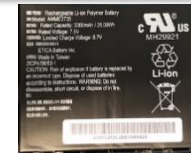
BTRY-ET5X-8IN3-01 8 in. Tablet Internal Battery