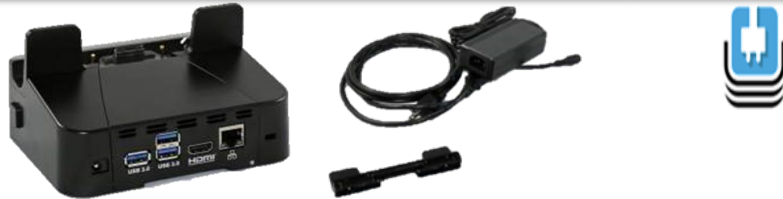
CRD-ET5X-1SCOM1 ET5X 1-Slot Charge and Communication Dock