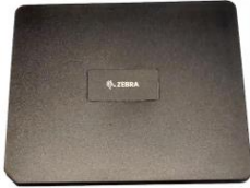
KT-ET5X-8BTDR2-01 ET51/ET56 8" Battery Door