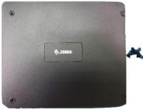
KT-ET5X-8BTDRSA1-01 ET51/ET56 8" Battery Cover Attached with Screws (Included)