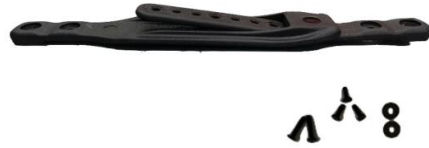
SG-ET5X-SFSTRAP1-01 ET5x Integrated Scanner Hand Strap Including Side and Back Mounting Screws