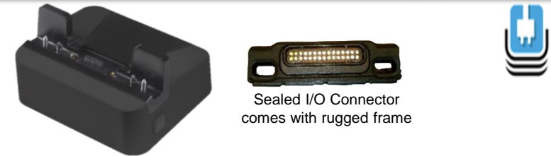
CRD-ET5X-1SCOM2R 1-Slot Dock with Rugged IO Adapter