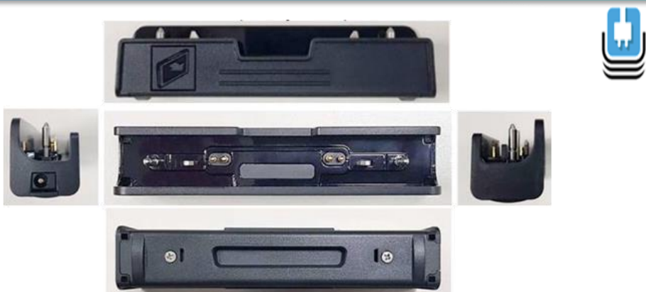
CHG-ET5X-CBL2-01 Rugged Charge Connector