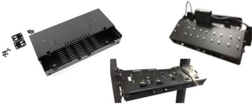
BRKT-SCRD-SMRK-01 Multi-Slot ShareCradle Mounting Bracket