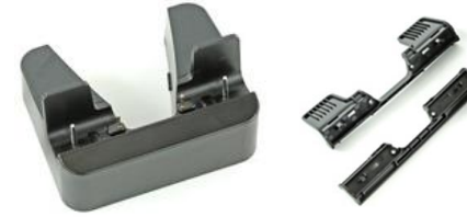
CRD-ET5X-1SCG2 ET5X 1-Slot Charge Only Dock