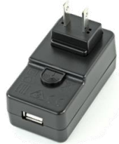
PWR-WUA5V12W0xx USB Power Supply