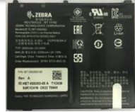
BTRY-ET5X-8IN5-01 8 in. Tablet Internal Battery