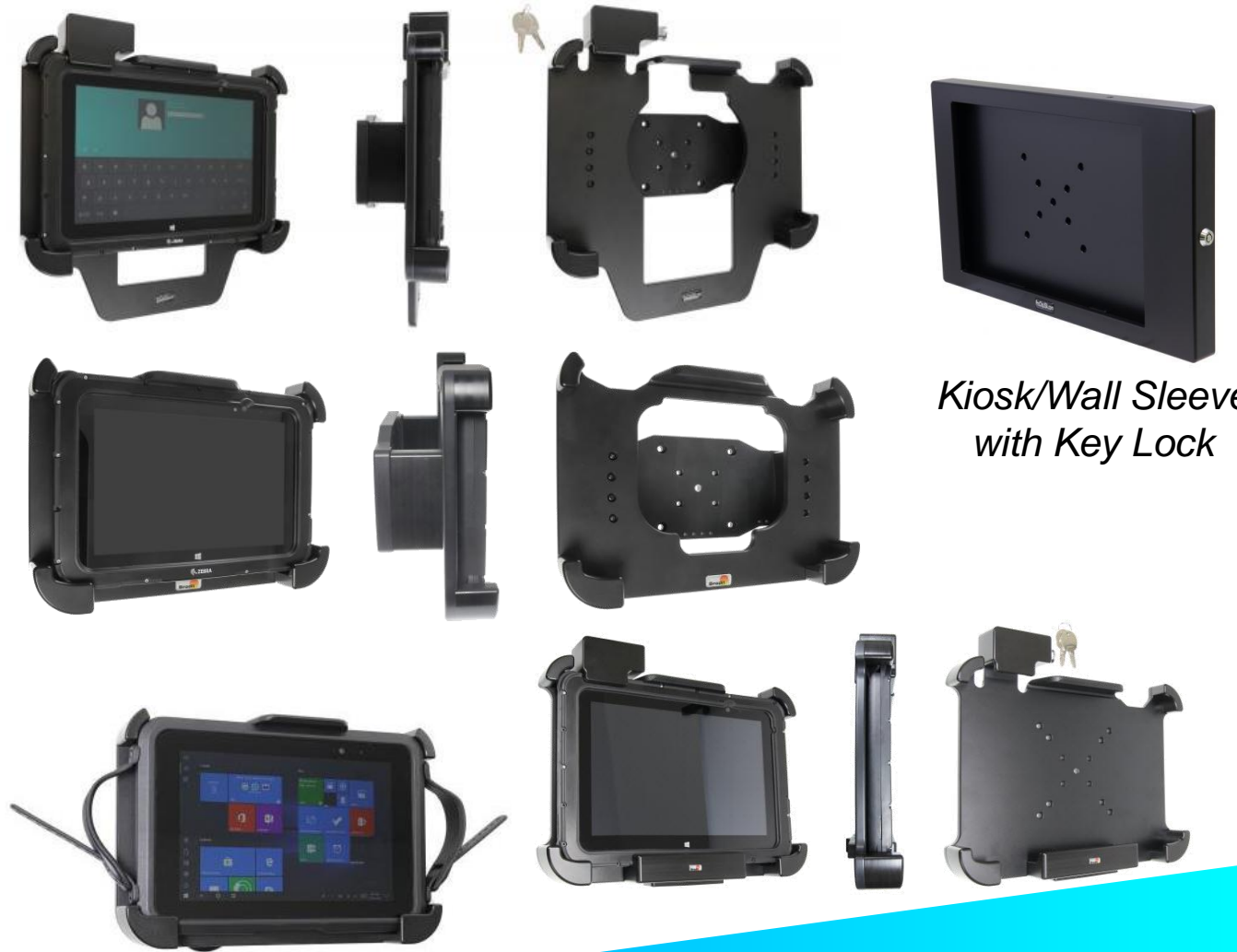
Kiosk/Wall Sleeve with Key Lock

For Europe contact Brodit AB Sweden, www.brodit.se